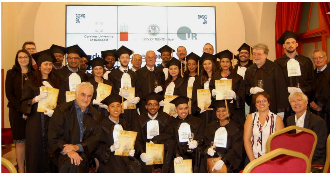
Master CoDe graduates with their professors

My last words for the graduating class were: be-positive, proactive, principled and productive. Discover from yourself and keep moving forward. God bless you all.