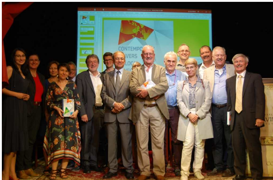
Editor and authors of "Contemporary Drivers of Local Development"

The online version of the book has also been published by the Institute for Local Self-Government Maribor and it is available on the publisher's website