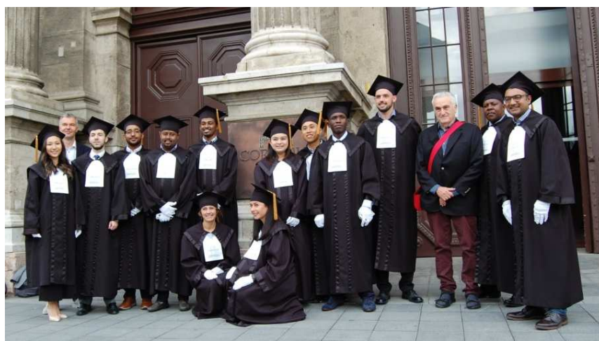
Master CoDe 2017/19 ready for the Graduation Ceremony

The Graduation Ceremony of the EM Master CoDe 2017/2019 edition took place at the Corvinus University of Budapest on Saturday, 7 September 2019.